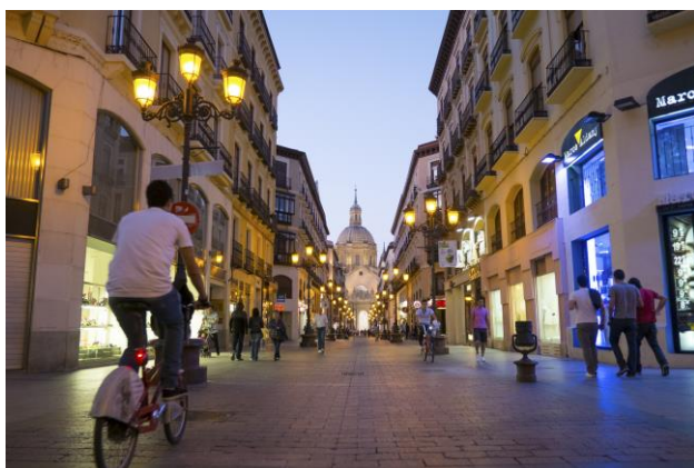
Centre of Zaragoza

Aragón in general is a territory in which education has played a fundamental social role. The University of Zaragoza dates back to the 16th century and today hosts an educational community of almost 40,000 members, with a strong commitment to internationalisation. In turn, the Aragonese education system is a pioneer in meeting the challenges of education in the 21st century, enhancing the quality of the system and favouring school success, without leaving behind the attention to diversity and the acceptance of foreign students, support for rural schools and educational innovation. Its vocational training system is also being promoted alongside the new Vocational Training Law in parallel with its industry, with centres of excellence in sectors such as automotive and renewable energies. Furthermore, the city of Zaragoza is a Child Friendly City and has a strong youth associative movement, including pro-European groups.