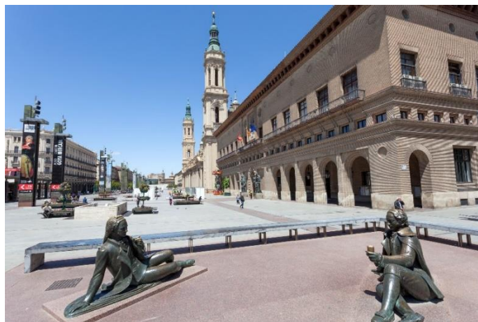
Plaza del Pilar

Hotel Palafox is located in the centre of Zaragoza city, just 800 metres from the Basilica del Pilar .