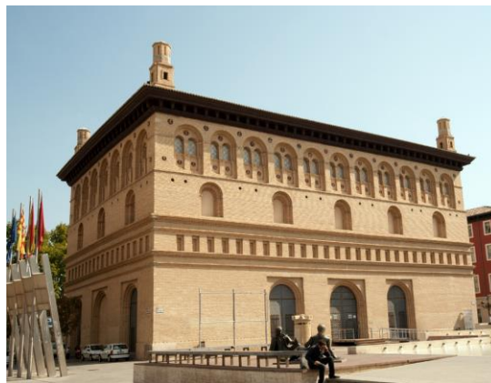
Zaragoza Fish Market